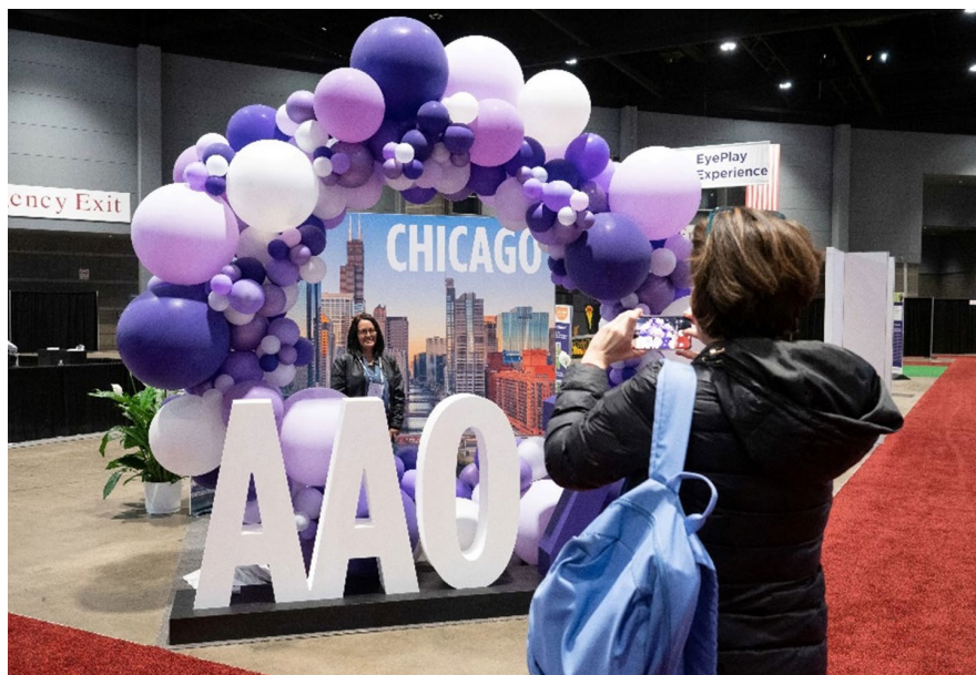
EXPO. The AAO 2024 Expo features hundreds of exhibitors and will take place in McCormick Place in Chicago.

Showcase Theater. Industry professionals and key opinion leaders will give 30-minute talks on the latest