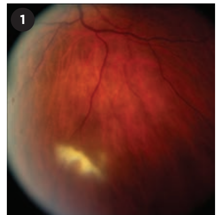
YEAST INFECTION. Fundus photo of a white, fluffy chorioretinal infiltrate erupting into the vitreous. Vitreous fluid grew Candida albicans .

conditions, infectious and noninfectious, should be considered in formulating the diagnosis. See “Differential Diagnosis” on the next page.