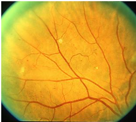
Standard photograph 8A , the standard for moderate IRMA. Patients with severe NPDR have moderate IRMA of at least this severity in at least 1 quadrant.

Reprinted with permission from the Early Treatment Diabetic Retinopathy Study Research Group. Grading diabetic retinopathy from stereoscopic color fundus photographs--an extension of the modified Airlie House classification: ETDRS report number 10. Ophthalmology 1991;98:786-806.