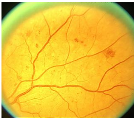
Standard photograph 2A , the standard for hemorrhages/microaneurysms. Eyes with severe NPDR have this degree of severity of hemorrhages and microaneurysms in all 4 midperipheral quadrants.

Severe nonproliferative diabetic retinopathy (NPDR): Using the 4-2-1 rule, the presence of at least one of the following features: (1) severe intraretinal hemorrhages and microaneurysms, equaling or exceeding standard photograph 2A, present in 4 quadrants; (2) venous beading in 2 or more quadrants (standard photograph 6A); or (3) moderate IRMA equaling or exceeding standard photograph 8A in 1 or more quadrants.