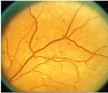
Standard photograph 6A , less severe of two standards for venous beading. Two main branches of the superior temporal vein show beading that is definite but not severe.