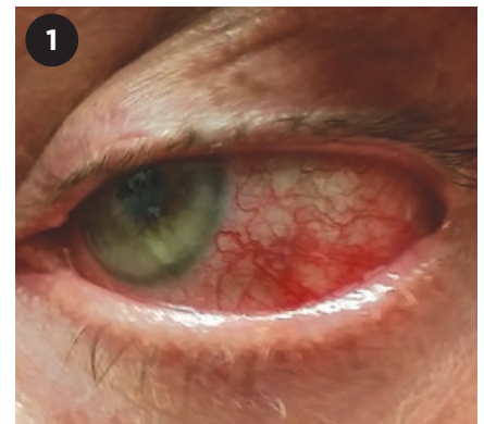
1 ANTERIOR SCLERITIS. Slit-lamp photo displays dilation of the episcleral vessels in a patient with underlying RA.

Diagnostic signs include less than 5 mm of tear extension on Schirmer's test, tear break-up time of 5 seconds or less, decreased lacrimal lake, and staining with fluorescein, rose bengal, or lissamine green. 1 Up to 25% of patients with RA meet criteria for secondary Sjögren syndrome, which is less commonly associated with xerostomia than is primary Sjögren syndrome. Notably, different HLA genes are associated with primary Sjögren syndrome and Sjögren syndrome secondary to RA. 2 Addition-