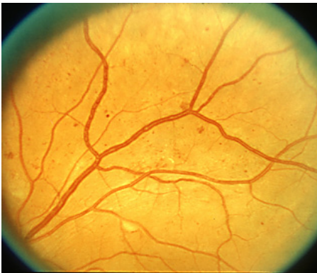
Standard photograph 6A , less severe of two standards for venous beading. Two main branches of the superior temporal vein show beading that is definite but not severe.