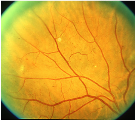
Standard photograph 8A , the standard for moderate IRMA. Patients with severe NPDR have moderate IRMA of at least this severity in at least one quadrant.

Reprinted with permission from the Early Treatment Diabetic Retinopathy Study Research Group. Grading diabetic retinopathy from stereoscopic color fundus photographs--an extension of the modified Airlie House classification: ETDRS report number 10. Ophthalmology 1991;98:786-806.