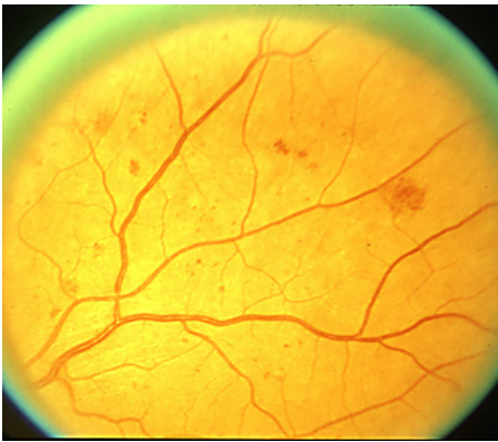
Standard photograph 2A , the standard for hemorrhages/microaneurysms. Eyes with severe NPDR have this degree of severity of hemorrhages and microaneurysms in all four midperipheral quadrants.

Severe nonproliferative diabetic retinopathy (NPDR): Using the 4-2-1 rule, the presence of at least one of the following features: (1) severe intraretinal hemorrhages and microaneurysms, equaling or exceeding standard photograph 2A, present in four quadrants; (2) venous beading in two or more quadrants (standard photograph 6A); or (3) moderate intraretinal microvascular abnormalities equaling or exceeding standard photograph 8A in one or more quadrants.