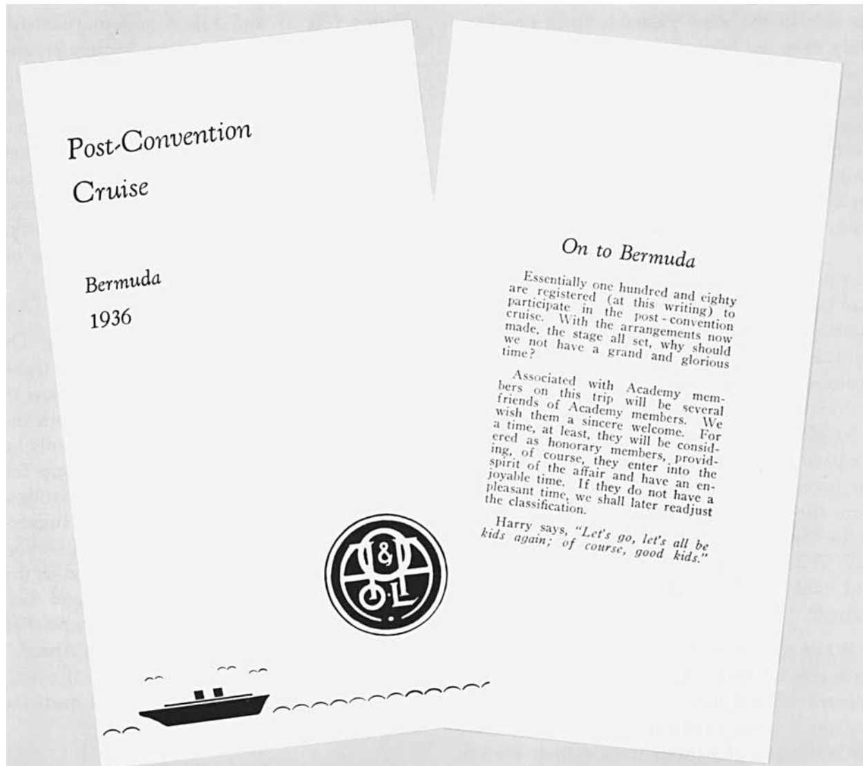
Fig 37.—Cover and inside page from program for 1936 postconvention cruise.