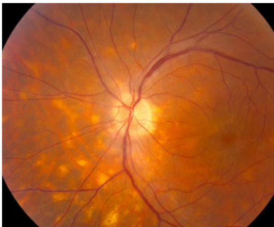
BIRDSHOT. This 42-year-old patient had birdshot chorioretinopathy and cystoid macular edema.

Care should be individualized. Physicians need to consider what is best for each patient, said Dr. Dunn. For some patients, for example, avoiding systemic side effects may be critical, and systemic therapy may not be the best option; regional corticosteroids might be the better choice. “You need to mix and match options with the patient’s profile.