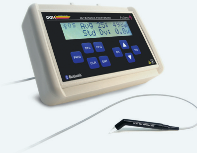
The New PACHETTE 4

VISIT US AT ASCRS BOOTH #1311 FOR SHOW SPECIALS