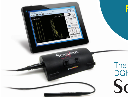
The DGH 6000 SCANMATE A Portable USB A-Scan

VISIT US AT ASCRS BOOTH #1311 FOR SHOW SPECIALS