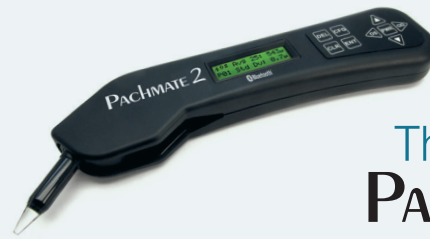
The New PACHIMATE 2