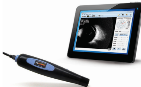
The DGH 8000 SCANMATE A Portable USB B-Scan